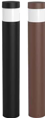
BOL-42-R-C-F-MCTP 42In Round Flat Top Cone Reflector Frosted Lens