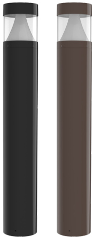
BOL-42-R-C-C-MCTP 42In Round Flat Top Cone Reflector Clear Lens